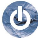
Exhibit Dates: August 28 – 30, 2018 Commonwealth Ballroom | (10'x10') Exhibit Booths